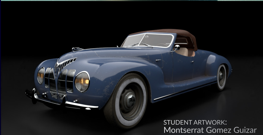
STUDENT ARTWORK: Montserrat Gomez Guizar

FOR MORE INFORMATION AND TO APPLY VISIT CEA.BOWVALLEYCOLLEGE.CA OR CONTACT: